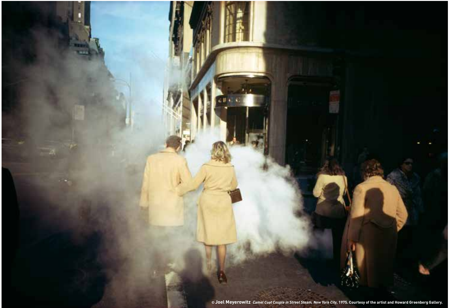
© Joel Meyerowitz Camel Coat Couple in Street Steam, New York City, 1975 . Courtesy of the artist and Howard Greenberg Gallery.

JIMEI X ARLES INTERNATIONAL PHOTO FESTIVAL WILL OPEN IN XIAMEN ON NOVEMBER 25 OPENING WEEKEND PROGRAM AND GUESTS ANNOUNCED!