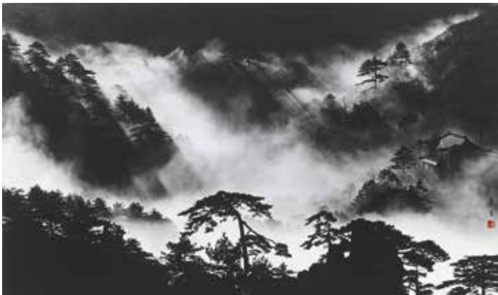
© 汪尧生,黄山系列, A104 W49, 1984年, 版权所有: 三影堂+3画廊 © Wang Wusheng, Mount Huangshan Series A104 W49 , 1984. Courtesy of Three Shadows + 3 Gallery

▼3场“印尼影汇”单元展览:展现当代印尼摄影,包括奥斯卡·蒙督鲁及Ruang MES 56的作品