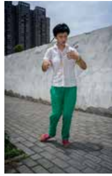
左: 王拓,《冥想》,2016年,单频4K影像,27秒26 Left: Wang Tuo, Meditation on Disappointing Reading , 2016 Single channel 4K video, 27min26sec