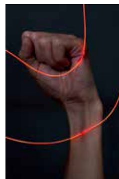
右: 胡为一,《我静静地等待光从身体穿过》,2014年 Right: Hu Weiwei, Flirt series , 2014

With two main sites in Xiamen's Jimei District and several other sites in the city, the festival aims to connect and animate separated cultural areas and spaces, to relay and promulgate different art forms through the city.