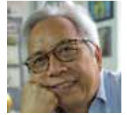
刘香成 Liu Heung Shing