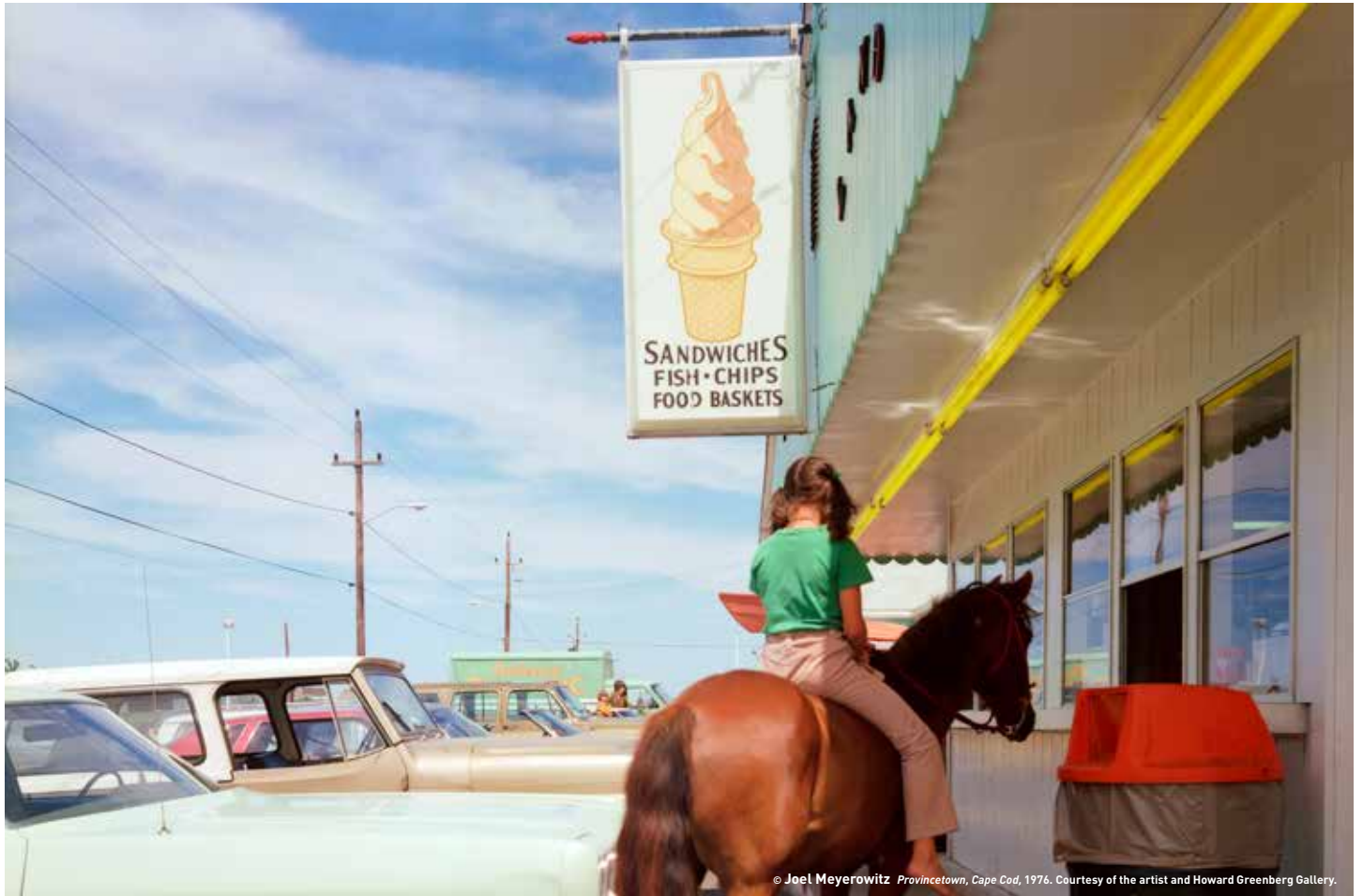
Provincetown, Cape Cod, 1976. Courtesy of the artist and Howard Greenberg Gallery.